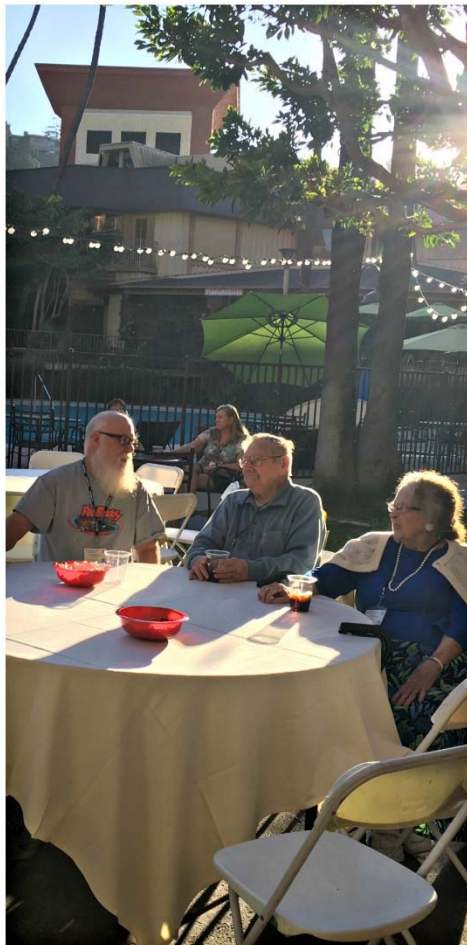
Mid-Winter Super Bowl Party